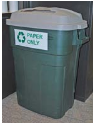
Paper Collection Bin

This includes junk mail, envelopes, office paper, greeting cards, paper tubes, wrapping paper and cereal boxes. Do not include paper towels, coffee cups or paper coated with food, wax, foil or plastic.